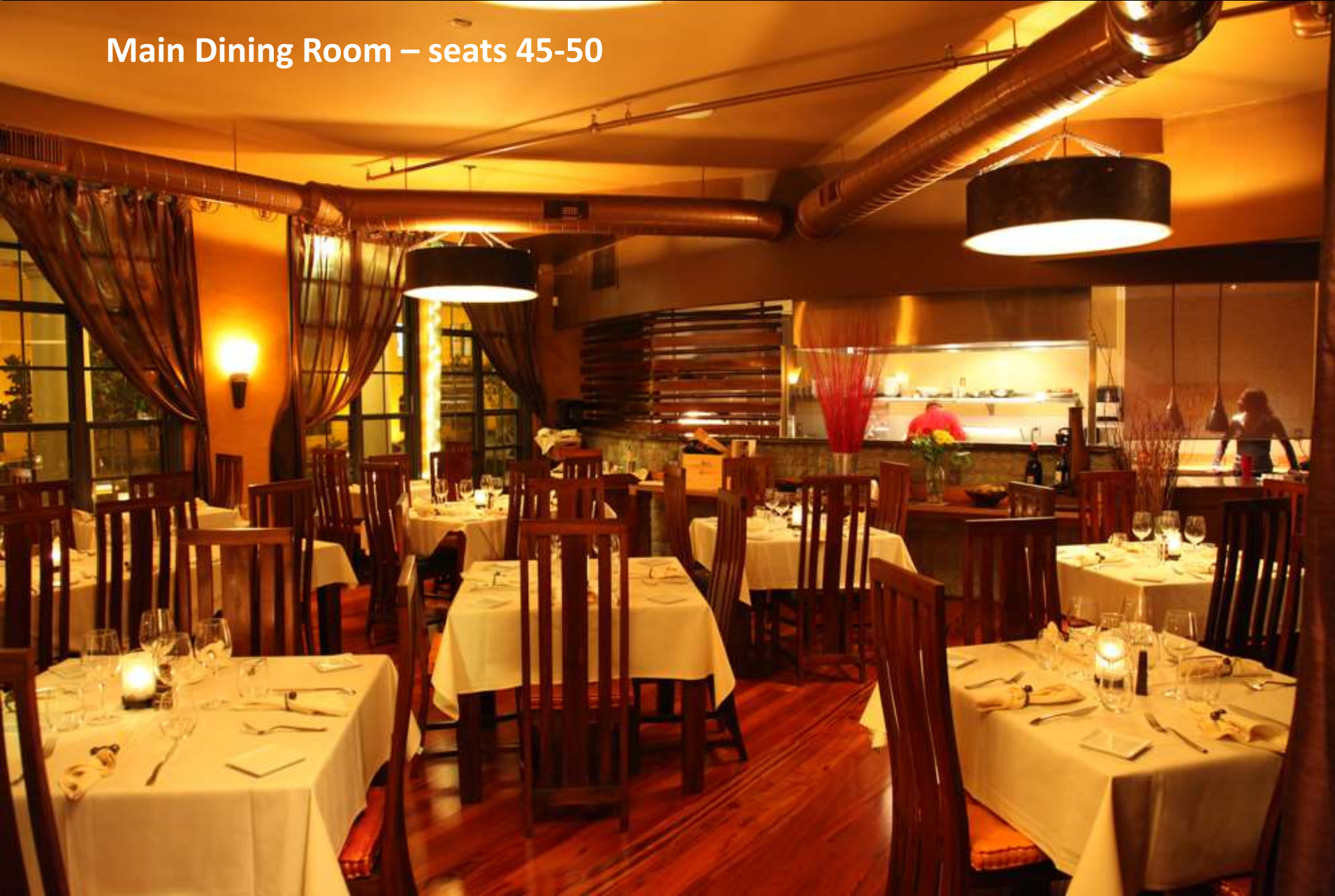
Main Dining Room – seats 45-50