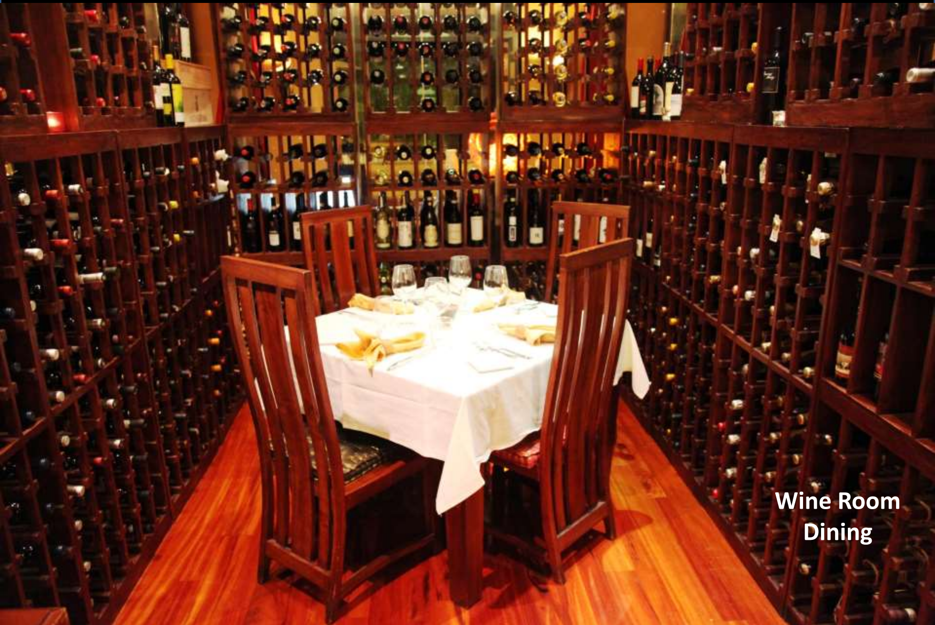
Wine Room Dining