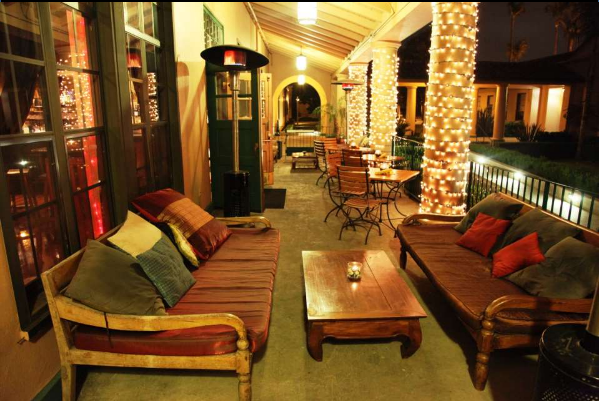
Side Patio – seats up to 35-40