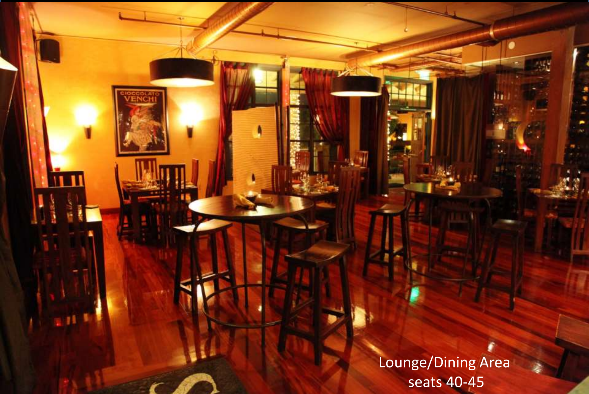
Lounge/Dining Area seats 40-45