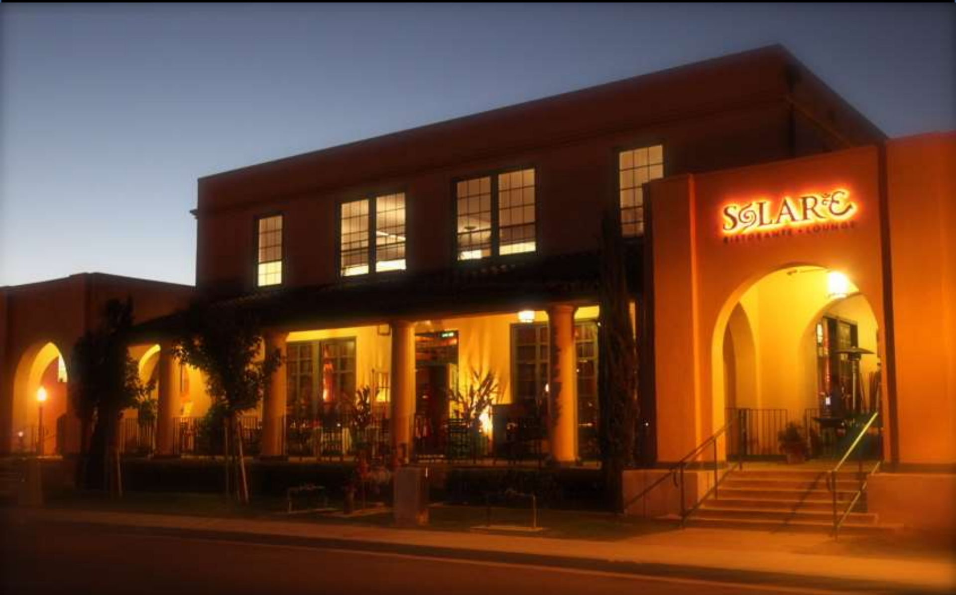
Beautiful Entrance with plenty of free parking